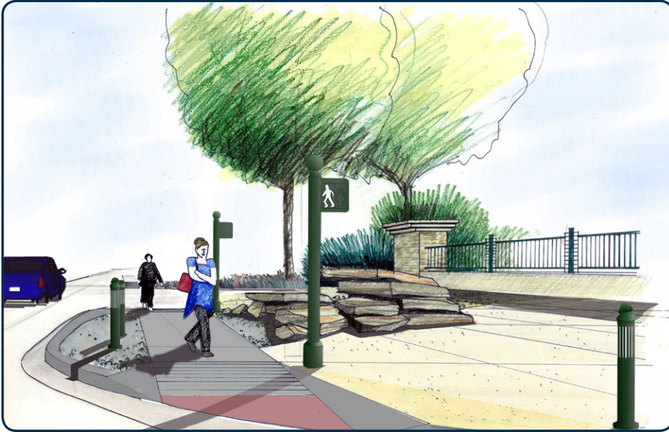
Sketch of pedestrian area in the Woodmen Academy Interchange, based on aesthetics committee input.

Construction is slated to begin on the Woodmen Road Improvement Project, Phase I in mid-September. Although the construction timeline is two years, that includes utility relocation, landscaping, and other time periods when the work is off of the main road. Also, remember